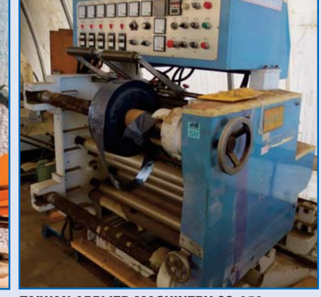
TAIWAN APPLIED MACHINERY CS-850 MULTI LINE SLITTING AND SIDE SEALING MACHINE