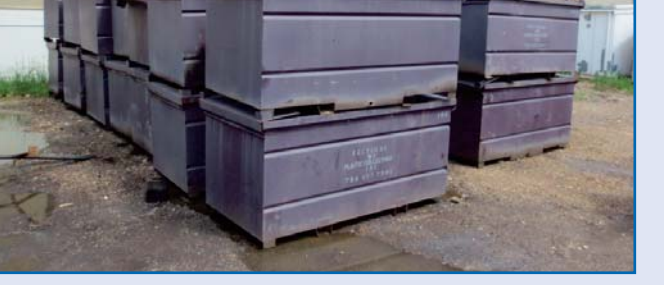
PARTIAL VIEW OF COLLECTION BINS