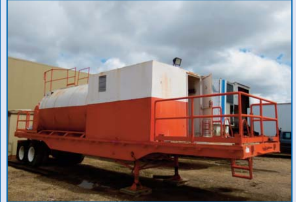
HOTSY TRAILER MOUNTED UNIT